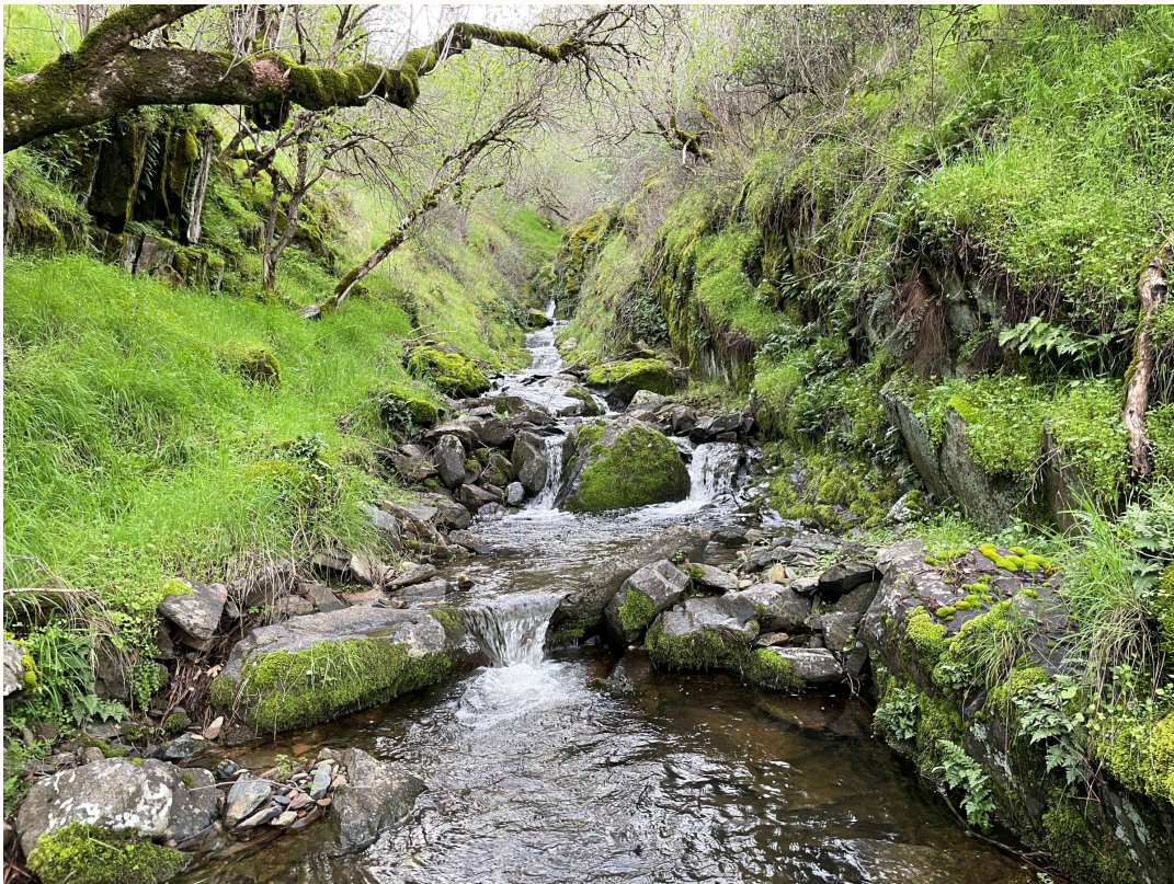
Typical early spring scenery along the Mokelumne Coast-to-Crest trail near Jackson.